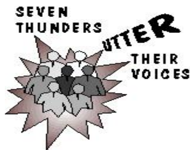
[VOICES OF HERESIES]

that, but these seven men are the seven thunders themselves, who will utter a revelation to give the Bride of Christ rapturing faith. This teaching, he illustrated on the diagrams below taken from one of his books.